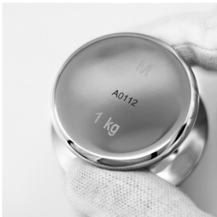
Example of optional laser marking