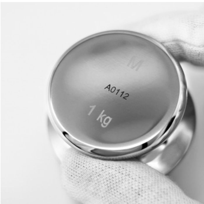
Example of optional laser marking