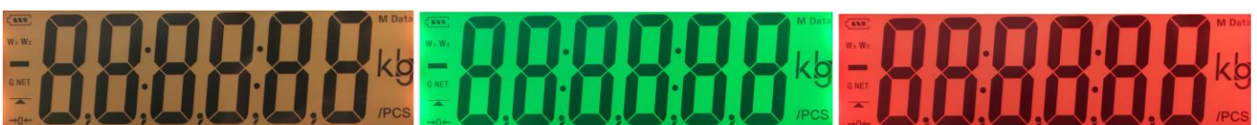
Adjustable Tri-Color Check Result Backlight

19i always deliver more than it is expected and the #1 choice whenever & wherever performance, reliability, durability and flexibility are of no compromise.